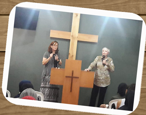
Speaking in Beirut

Your gifts and prayers make all of this possible. They are eternal investments.