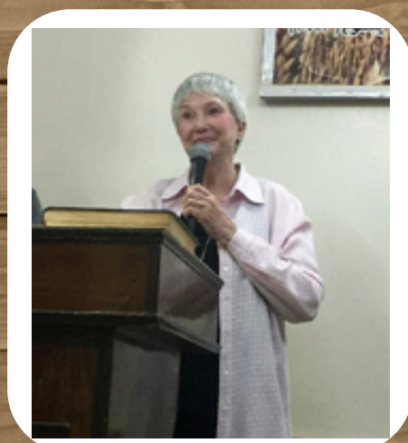
Bakka Valley, Lebanon