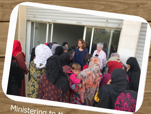
Ministering to the women in Bakka